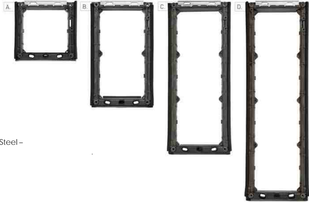
Sinthesi Steel -